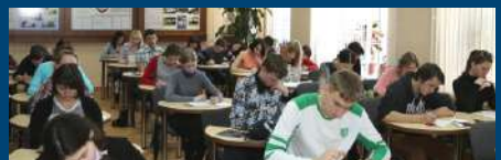
Students giving their final exams at the examination hall