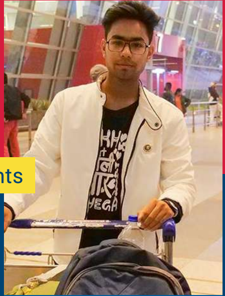
A student at the IGI Airport departing for his MBBS study at MaSU