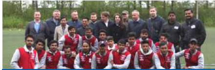
Post winning group picture with the rector of the university and cheerful smiles