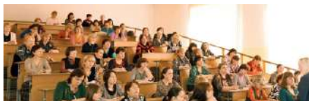
Students attending the guest lecture at the university auditorium