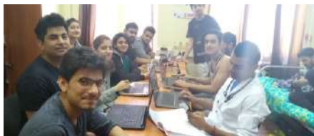
Group study time for learning and growing together