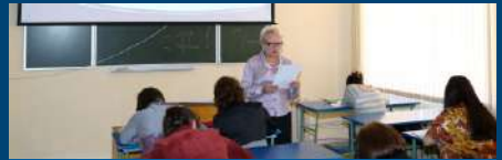
Classroom teaching for a group of 6 students in the university mega classroom