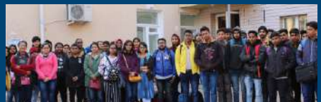
Student departing for their homes during the semester break