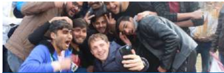
Students candidly posing for the selfie with the rector of the university.