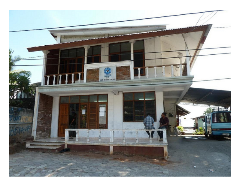
The Resource Centre is on the Ground Floor

Baucau located in the eastern part of Timor-Leste, is the second-largest city in Timor-Leste and lies 122 km east of Dili and has a population of around 16,000 people.