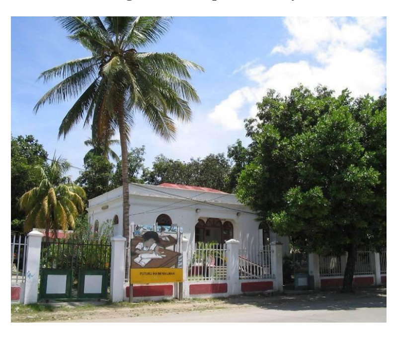
View of the Xanana Gusmao Reading Room