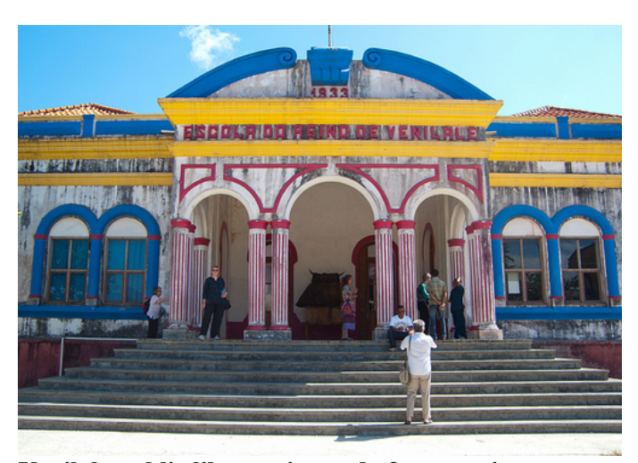
Venilale public library: in need of restoration

Venilale is Venilale is perched in the mountains of Timor Leste's eastern regions. The nearest major town to Venilale is Baucau, the second-biggest city in Timor-Leste. The Venilale Public library is Located within the Escola do Reino de Venilale. Originally built 1933 as a church it was refurbished in 2002 with funding from Swatch International and National Television of Portugal. The vision was for a joint school and public library, however, due to a lack of ongoing funding, the library no longer operates as an ongoing service to the community.