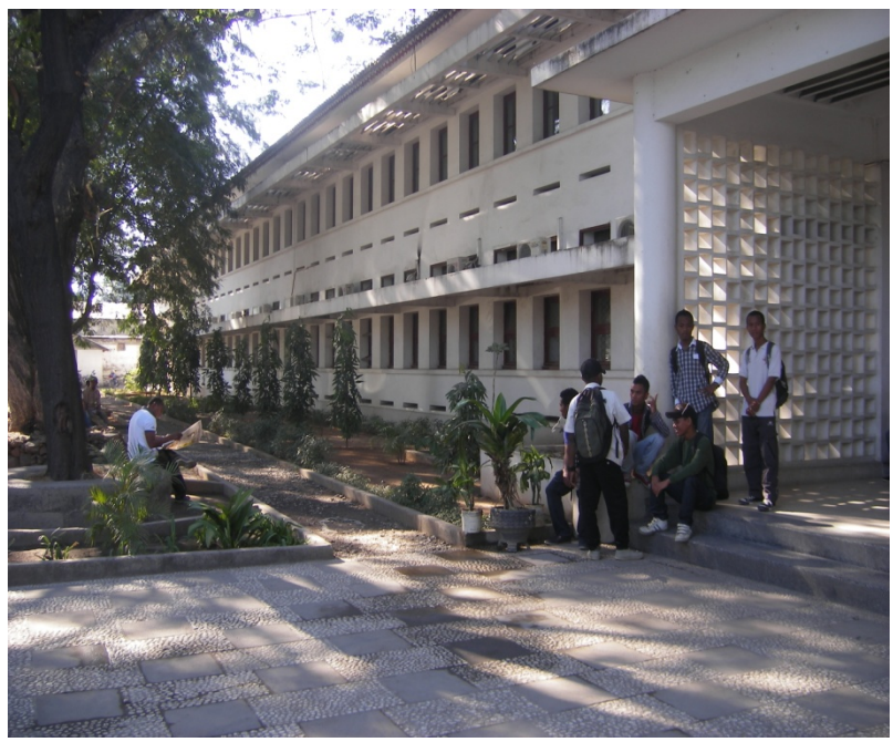
Dili Campus, 2011

Universidade Nacionál Timór Lorosa'e Timor–Leste (UNTL), which was previously known as UNTIM (Universitas Timor-Timur) is the only state university in Timor-Leste. The university, founded in 1986, is located in the centre of Dili with a smaller campus at Hera 6 kms from the capital city. The main library was built at Hera in 1989.