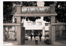
Workshop on heart diseases