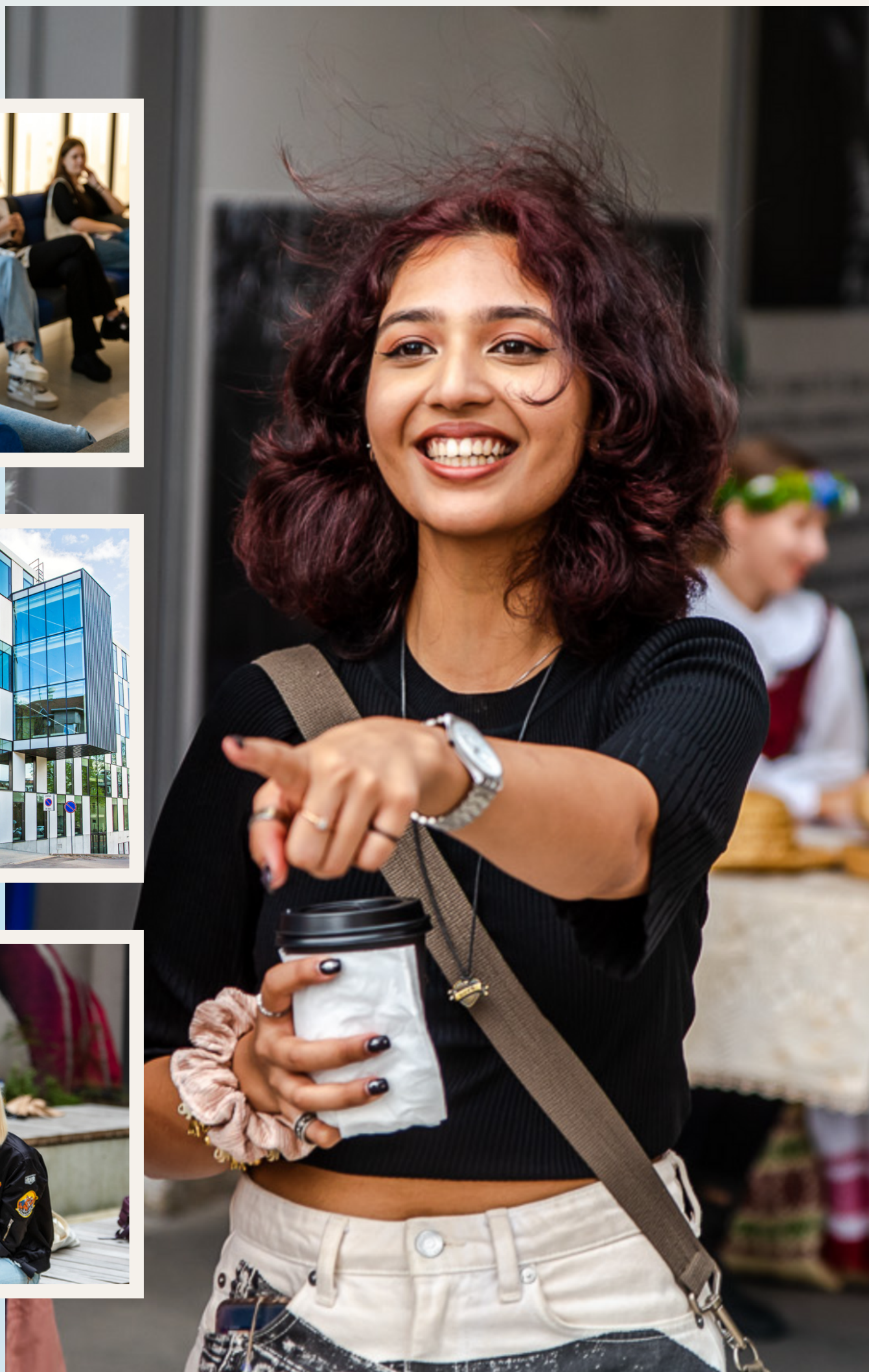
Vytautas Magnus University students