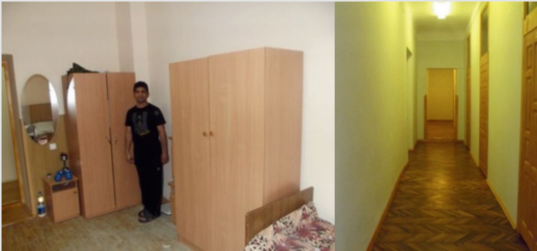
Hostel No 5 (Bilousova Str., 20,)