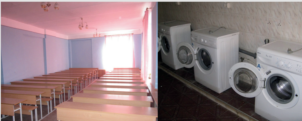
Hostel No 6 (Bilousova Str., 20,)