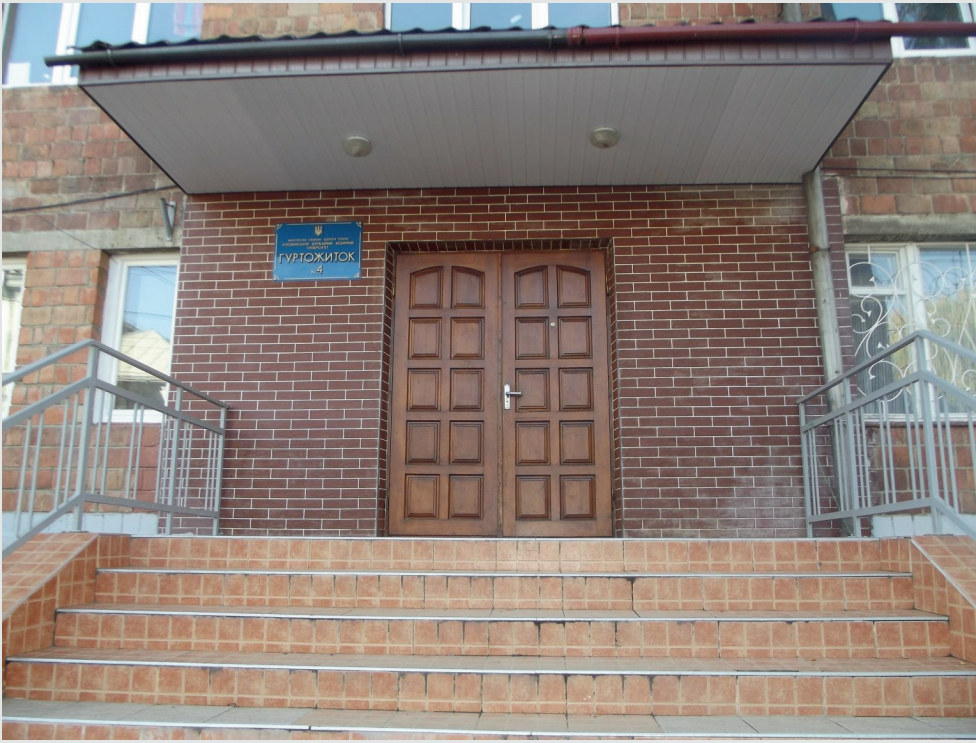
Hostel No 4 (Bilousova Str., 20,)